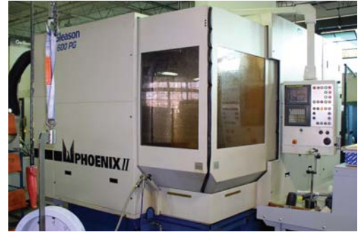
Gleason Phoenix II 600