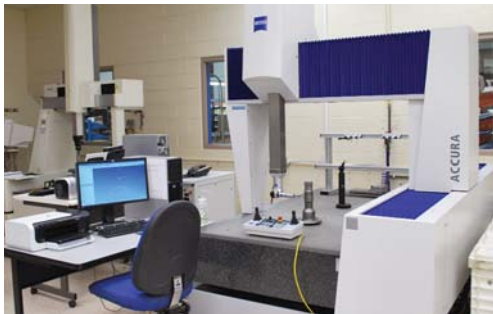
Zeiss Coordinate Measuring Machine