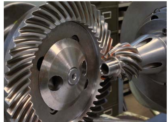
In-Process Testing of Bevel Gears