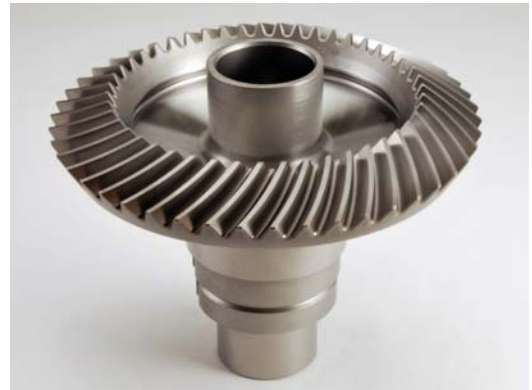
Spiral Bevel Gear