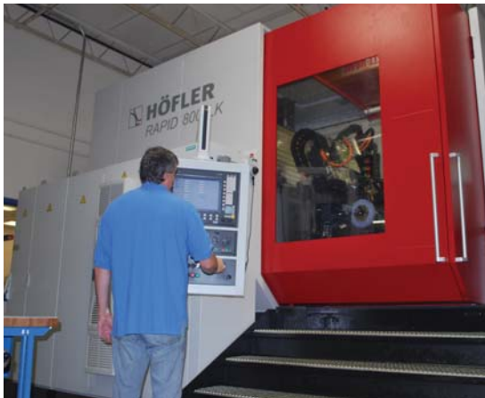
Hofler Rapid 800