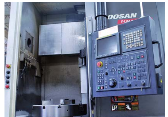
Doosan Vertical Turning Lathe