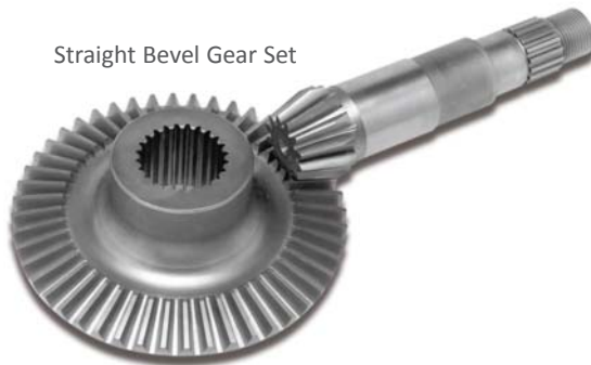
Straight Bevel Gear Set

Arrow produces bevel gears up to 30 inches in diameter at quality levels of Q13