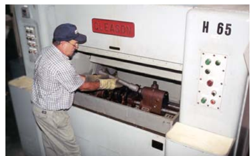
Gleason Rolling Quench Press

Arrow's Heat Treat facility is Nadcap certified.