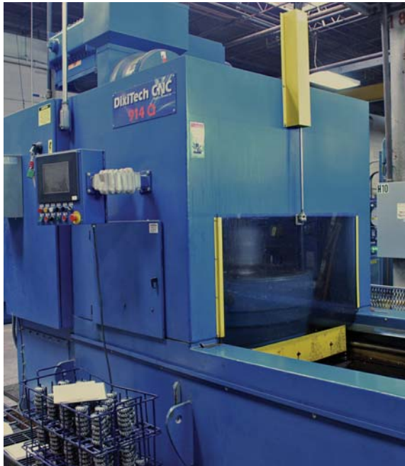
Dixitech Quench Press